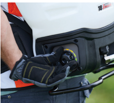
Protected Battery Compartment Access Door