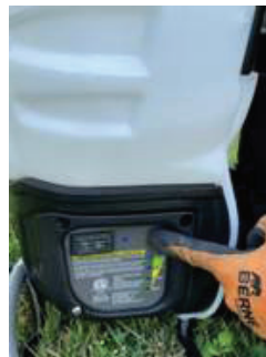
Power Switch & Battery State of Charge Indicator